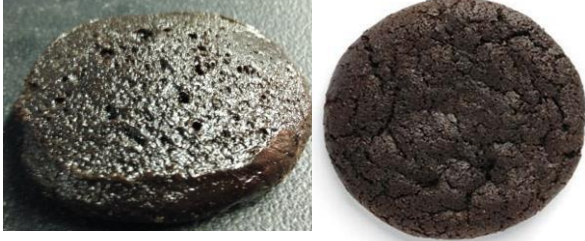
* Images provided for reference only. Actual item size and dimensions may be different.

Food Name: NATURALLY FLAVORED CHOCOLATE BROWNIE FROZEN COOKIE DOUGH MADE WITH WHOLE GRAIN Finished Food: NATURALLY FLAVORED CHOCOLATE BROWNIE COOKIES MADE WITH WHOLE GRAIN Brand/Customer: OTIS SPUNKMEYER® Sub Brand: DELICIOUS ESSENTIALS